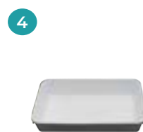
4. Plastic tray Cat. 9000743 (Masticator) Cat. 900011524 (Maxicator)