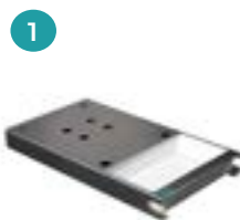
1. Stand and tray for any 400 ml Masticator Cat. 9000742