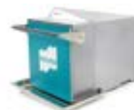
3500 ml bags