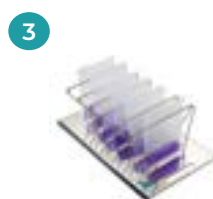
3. Stainless steel holder for six 80 ml bags Cat. 90002380