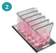
2. Stainless steel holder for six 400 ml bags Cat. 90002300