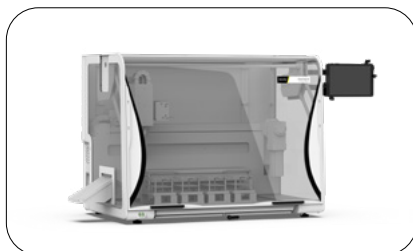
Prep 96 (Part No. 51-02A-1)