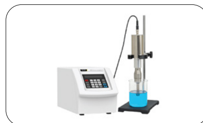
OM 500 (Part No. 29-060-450-xxx)