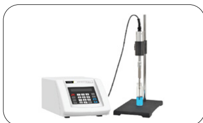
OM 100 (Part No. 29-060-100-xxx)