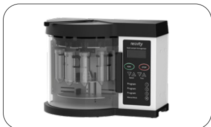
Omni Prep (Part No. 06-021)