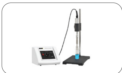
OM 50 (Part No. 29-060-050-xxx)