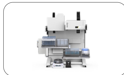
LH 96 (Inquire)