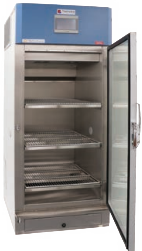
Thermoline's Australian Made Refrigerated Temperature and Humidity Chamber

We work with end users, resellers, service agents, builders and architects to create solutions and to meet individual requirements, utilising the full range of products we have to offer.