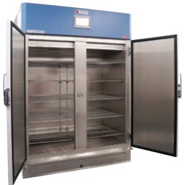
Thermoline's Australian Made Refrigerated Temperature and Humidity Chamber

We currently employ 30 staff with various skills and certifications throughout the business. In manufacturing, we have tradespeople with refrigeration, electrical, plumbing and sheet metal fabrication certificates. Led by an experienced management team with design and engineering backgrounds, we can often design and manufacture a product to suit any custom application.